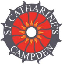
St Catharine's Chipping Campden