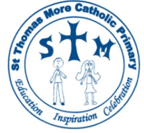
St Thomas More Catholic Primary Cheltenham