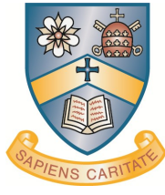
Catholic School of St Gregory The Great, Cheltenham