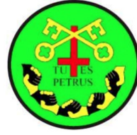
St Peter's Gloucester