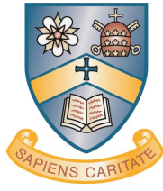
Catholic School of St Gregory The Great, Cheltenham