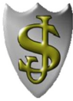
St Joseph's Nympsfield