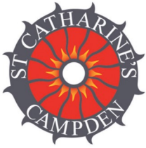
St Catharine's Chipping Campden