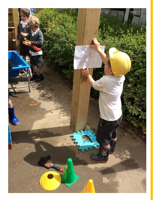
St Joseph's Catholic Primary School Information for New Parents